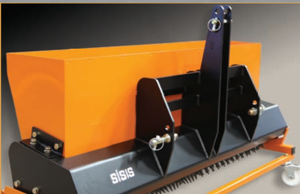
Standard cat 1, 3 point linkage for easy fitting to any tractor