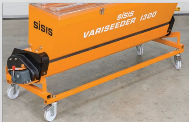
Transport trolley – storage trolley for ease of movement in the shed/workshop