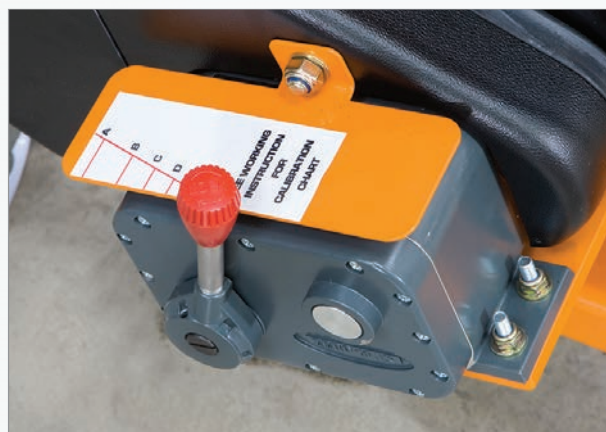
Zero Max Box for variable seed rates