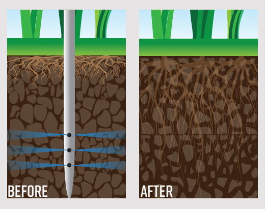
LATERAL AIR INJECTIONS INCREASE POROSITY, PROMOTES IMPROVED ABSORPTION AND DEEPER ROOT GROWTH